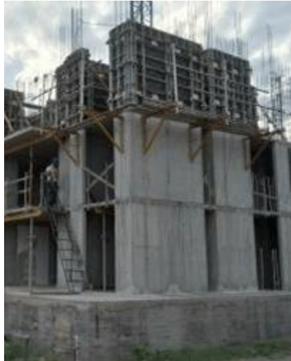
Figure 1. Typical concrete structure