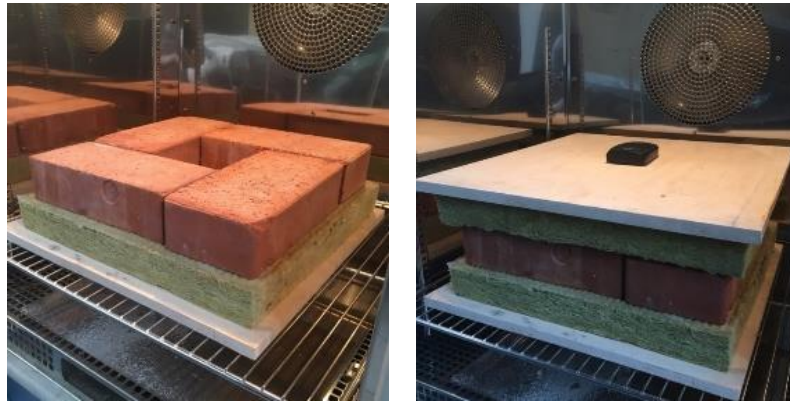
Figure 4. Chamber conditions for brick structure

Similar to the last one, it consists of the following: a wooden board, a heater, a brick sample. The time and temperatures were the same as the experiment of reinforced concrete structure. A sample is shown in Figure 4.