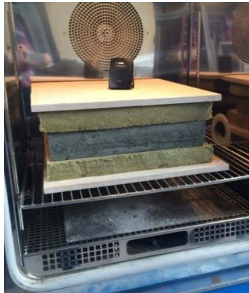
Figure 3. Chamber conditions for reinforced concrete structure

It consists of the following: a wooden board, a heater, a reinforced concrete sample. It is represented in Figure 3.