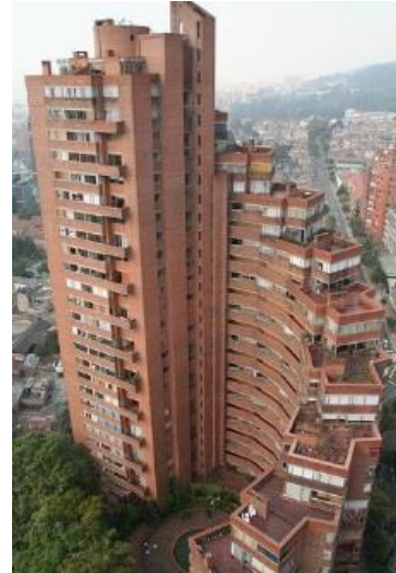
Figure 2. Construction with bricks

Bricks / masonry are the typical and most used material in Colombia. It is in direct contact with the outside with no layers that divide it from the inside [4]. The reason of the highly use of bricks in Bogotá is what is called the “Bricks Culture” which has made the identity of the city; new bold and adventurous designs make the city unique over others, furthermore with international recognition [5]. Constructions made of bricks are much more expensive than those in concrete, but what makes the difference is the low prices of labour or workforce. This makes an advantage for allowing big projects to be made out of bricks (Fig. 2). The main reasons for positioning this material in Bogotá was that during the 50’s the best recognized architects used massively bricks for almost all projects, with new designs and textures they gave the actual prestige to the material. Another reason is the abundance of production factories among the country. On the other hand, concrete is mostly used for simple designs and fast construction, moreover concrete is much cheaper than bricks [6].