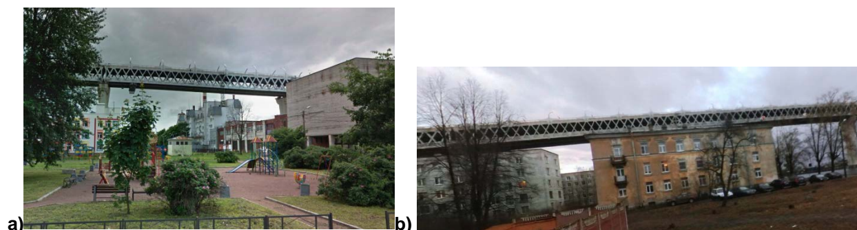
Figure 2. Views of the vehicle overpass on Kanonersky island, St. Petersburg: a) the vehicle overpass above the playground; b) the vehicle overpass in a dense residential development

Figure 2 shows the views of the vehicle overpass on Kanonersky island in St. Petersburg.