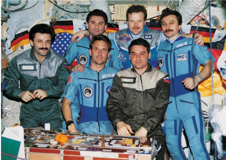
Fig. 1. This crew of the Mir station survived the most dangerous fire in the history of piloted space flights. February 1997.

cosmonauts activated three fire extinguishers, burning of the oxygen generator was eventually suppressed. However, it took a very long time to recover normal atmosphere suitable for breathing.