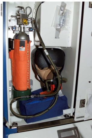
Fig. 3. The Portable Breathing Apparatus (PBA).

For US crew members, the primary individual mean of protection is the Portable Breathing Apparatus (PBA) shown in Fig. 3. It consists of the mask and the gas bottle that provides oxygen for 7-15 min of work depending on its intensity. The PBAs can be connected to the oxygen ports in the US segment. For the PBAs, the safety distance of 1 m away from an open flame must be provided. In case of fire, all the crew members can use both Russian breathing masks and US Segment breathing apparatuses.