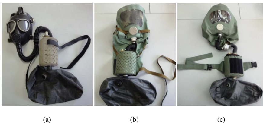
Fig. 2. The breathing protective mask ИПК: (a) – used before 2004; (b) – used before 2014; (c) – currently used.

Generation of toxic volatiles in the thermal decomposition of polymers is extremely hazardous for the crew members. Indeed, in the enclosed space of the ISS the concentrations of toxic species can rapidly build up to a level greatly exceeding the tolerable threshold. Safety of the crew members can be provided by either using individual gas masks or by creating a safety zone. In view of the spatial restrictions, creation of a safety zone may be rather difficult.