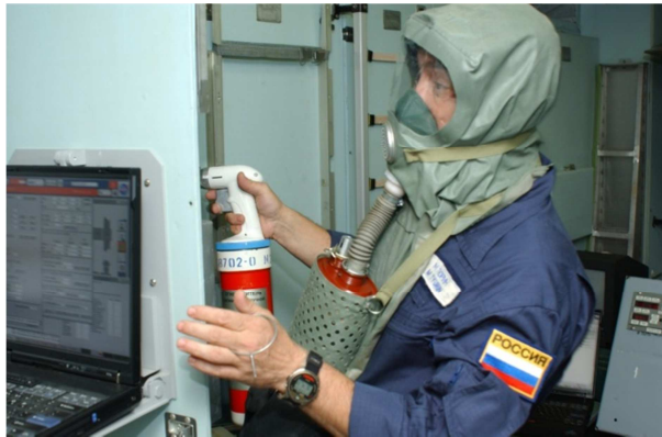
Fig. 6. Fire training in the Gagarin Training Center.

The crew actions must take into account the availability of individual fire protection, fire suppression tools, facilities for removal of toxic combustion products from the atmosphere and the equipment to control its composition. Prior to the orbital flight, the crew members undergo the extensive training on acting in accidents, see Fig. 6. The first actions to be undertaken after the automatic fire detection system activates are of key importance and must be remembered exactly. If for any reason, the automatic detection system does not activate in case of fire, the system must be activated manually. It will inform all the crew members of the fire, and it also will deactivate certain onboard systems and initiate passive fire suppression.