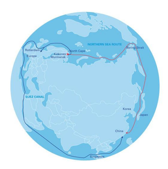
Picture 1. Northern Sea Route (red) and Suez channel route (blue).

No one will argue that Russian Arctic is greatly isolated from the industrial and economic centers of the country, that is why efficient exploitation of the treasures the region can offer depends heavily on its infrastructure development. The backbone of AZRF transportation system is the Northern Sea Route (NSR) – a shipping passage stretching from the North Atlantic along the Siberian coast to the Russian Far East and the Pacific Ocean.