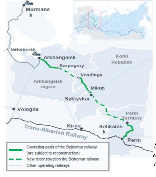
Picture 2. "Belkomur" project.

In 1996, when construction of the railway "Belkomur" was commenced, its strategic significance was clear – giving northern regions of European Russia, such as Komi republic and Arkhangelsk oblast, and Urals direct access to nonfreezing port of Murmansk and port of Arkhangelsk for further access to Northern Europe. It was planned to build 1115 km of the road. Now only three parts of the railway – Arkhangelsk-Karpogory, Vendinga-Syktyvkar and Solikamsk-Perm, which make up about 440 km – are operational, but still need modernization [1]. The project is struggling to find investors. The latest auction planned for March 26, 2018 did not take place as there were no tenders [2]. The main reason for that is constantly increasing cost of the project and lack of financing from the regional budgets.