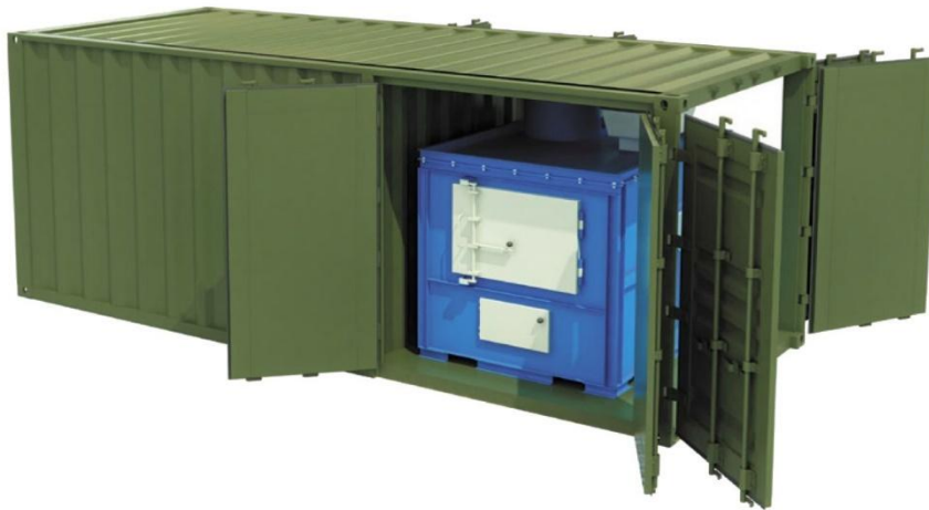
Figure 1 - Module with incinerator

From the places of permanent deployment, as a rule, the removal of solid household waste is handled by the municipal organizations of a particular region with which the relevant contracts have been concluded, and the waste disposal process is carried out according to the methods used in a particular region, often consisting of landfills. Solid domestic waste generated during the quartering of military units in the field is not disposed of at all, however, modern autonomous field camps like the APL-500 [4] are equipped with a module with an incineration plant (Figure 1), capable of utilizing not only solid waste but also a solid component sewage effluent [5]. The operation of such an installation causes serious damage to the environment, its use is advisable only in the absence of other methods of disposal.