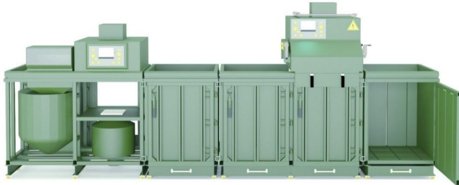
Figure 2 - General view of the system

recycling and processing of solid domestic waste (see Figure 2) developed specifically for military units, which allows sorting, compaction of solid waste and processing of polymer wastes directly in the places of permanent disposition of units, incl. in the field.