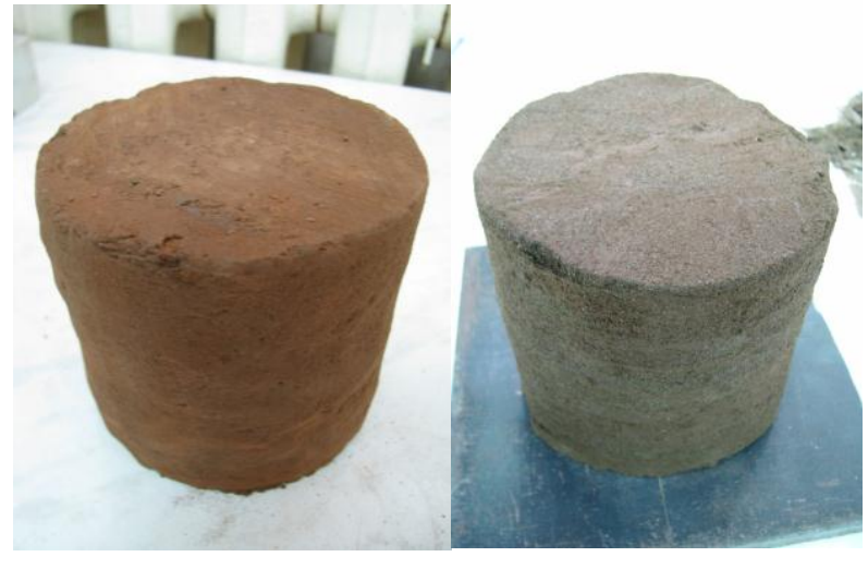
a) Claystone b) Sandstone