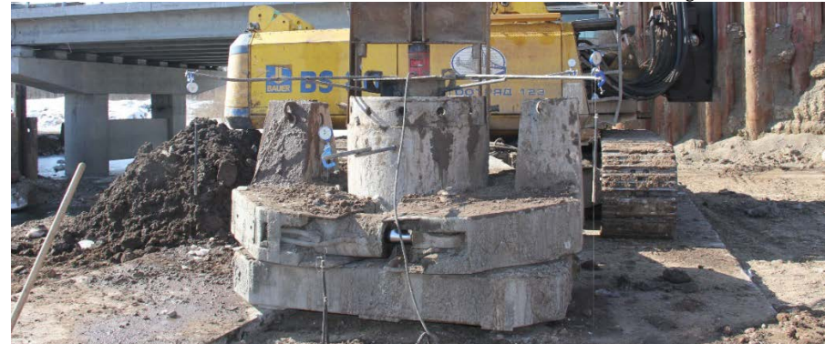
Figure 2. Plate-bearing test.