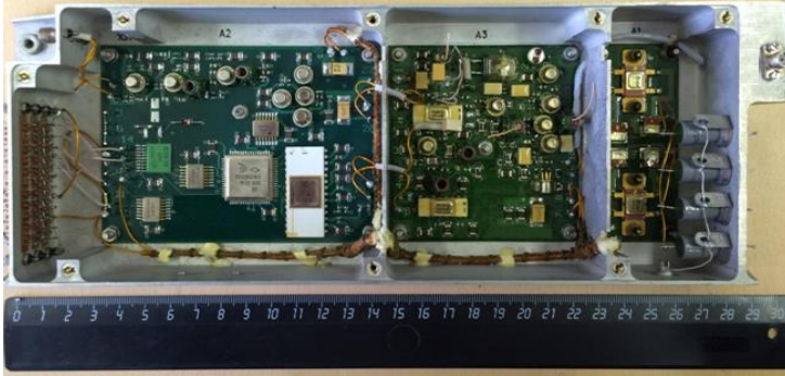
Fig.1. New design of the frequency synthesizer.

In Fig. 1 new design of the frequency synthesizer is presented.